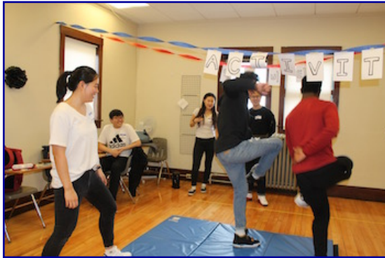
Visitors to South Korea compete in the Chicken Fight game.