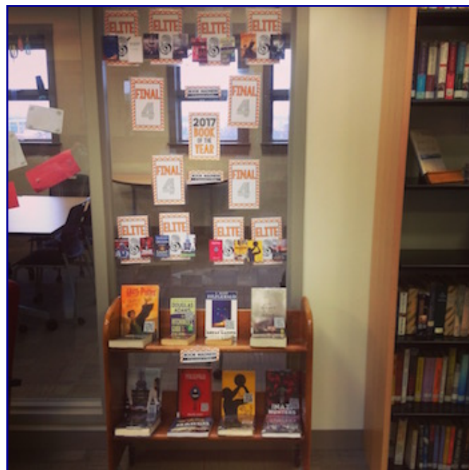
Did you vote in the March Madness polls to select the 2017 Book of the Year at SJP?