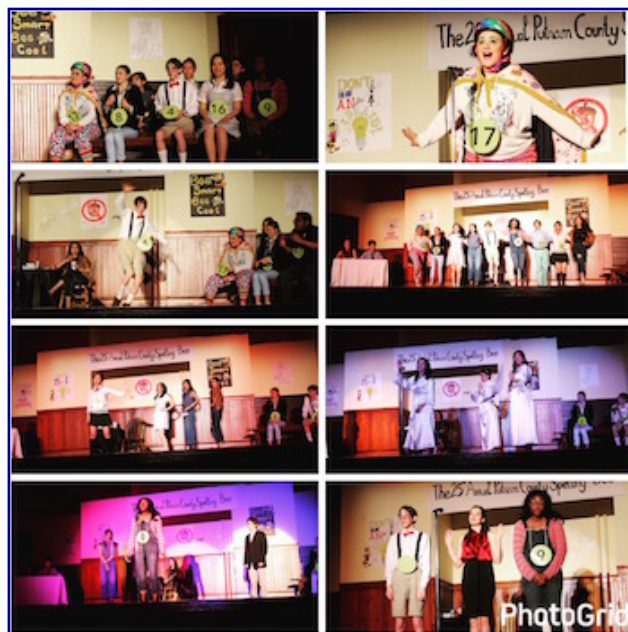
Collage of scenes from the Spelling Bee

What will the Multicultural Day menu offer next year?