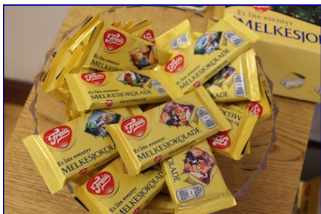
Delectable chocolate from Norway.

Next came Norway, where the scenery is beautiful and the chocolate is amazing. The Freia chocolate was my favorite thing, and I look forward to it each year.